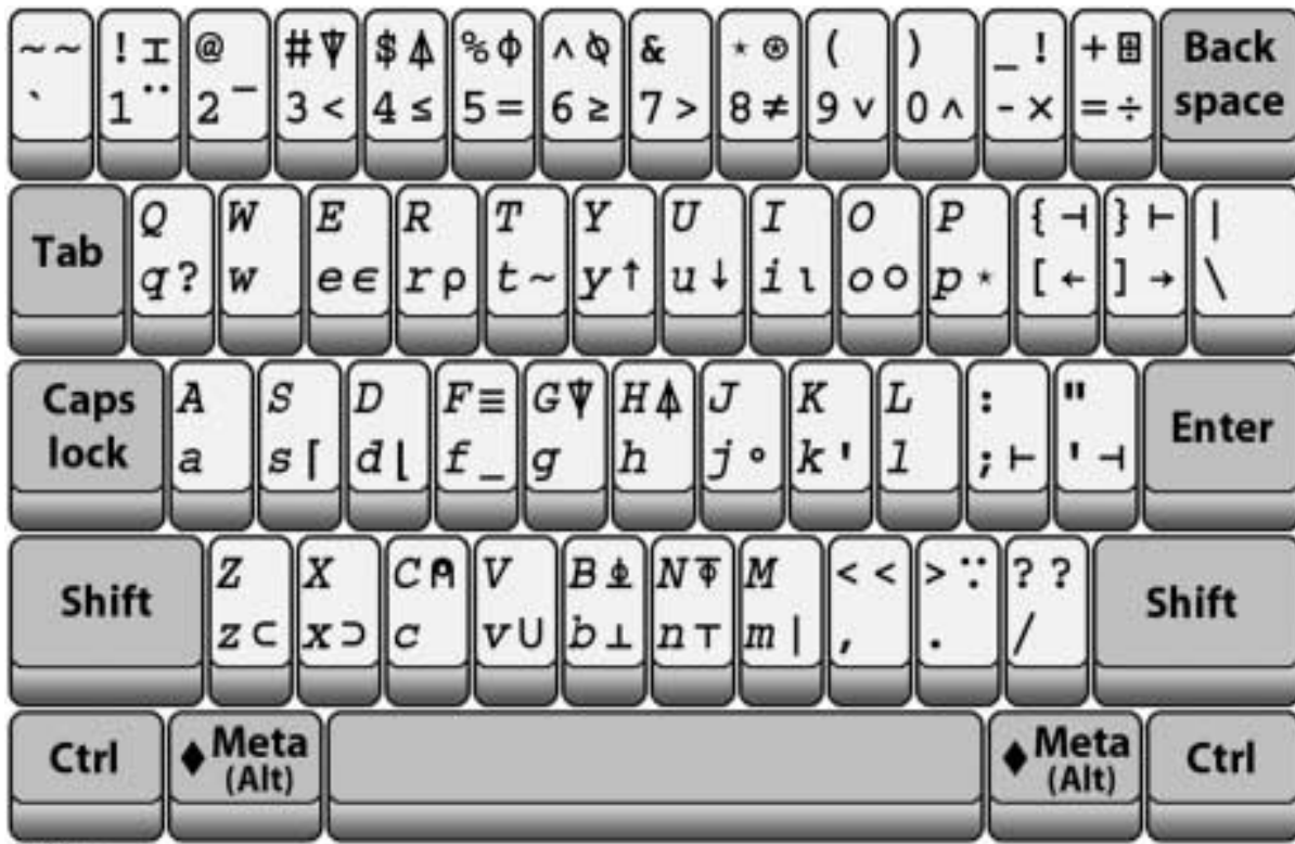
Layout of the A+ Keyboard, showing only those characters which have defined meanings in A+