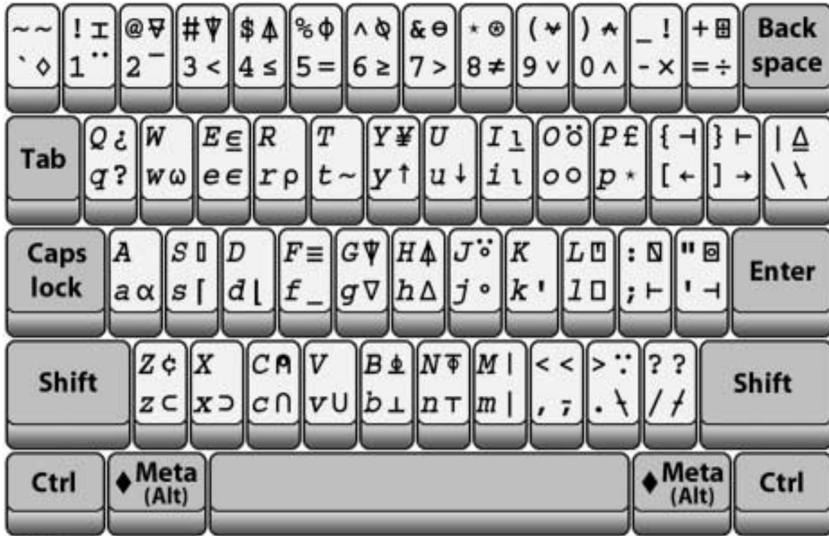
Layout of the A+ Keyboard, showing the locations of all of the characters in the A+ font